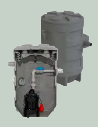
SANIFOS 280 GR